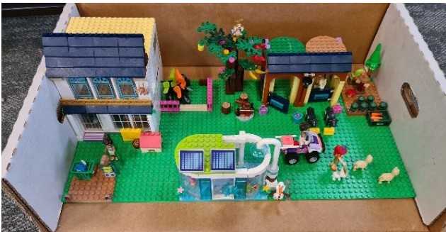
5-6 Chloe S