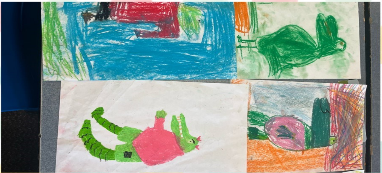
Some of our art work in 2/3 Main