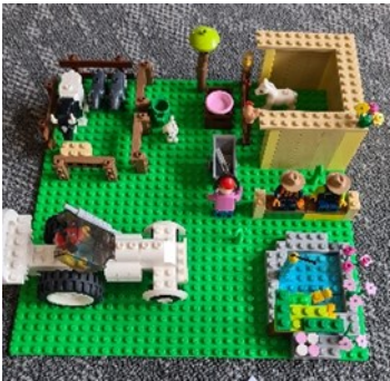
K-P Evie W