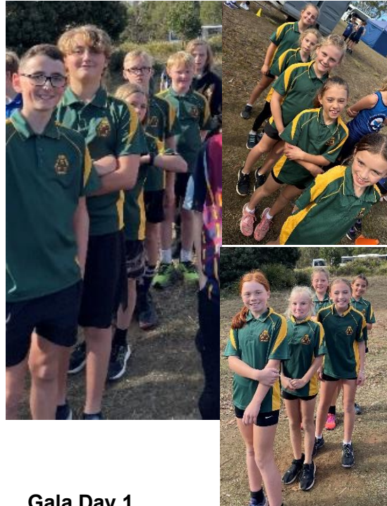
Gala Day 1