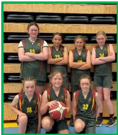
Grade 5/6 Girls Yellow Basketball