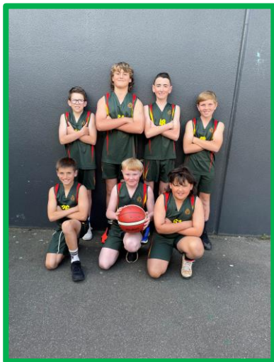
Grade 5/6 Boys Basketball